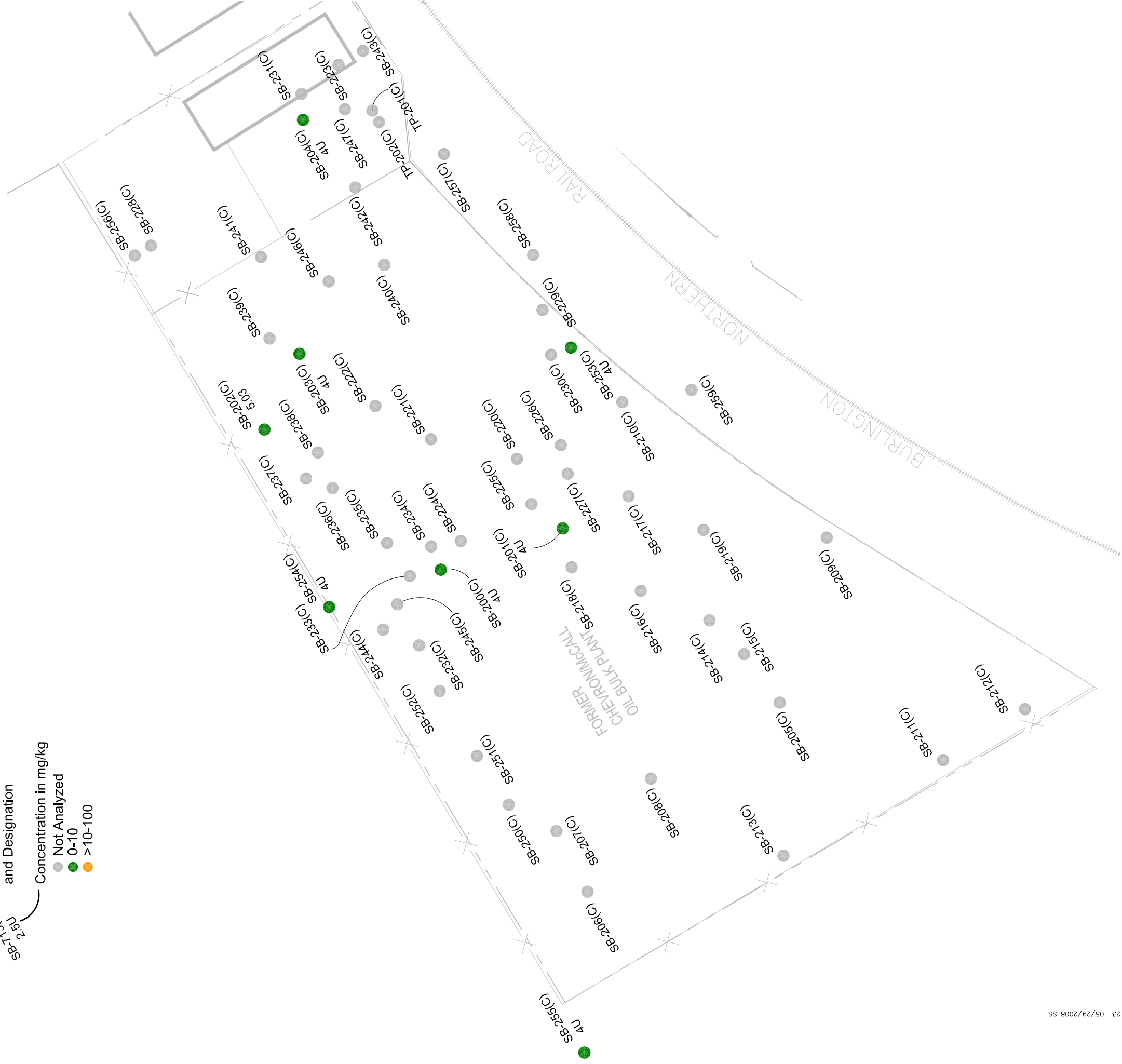
Key Plan - AOC 3