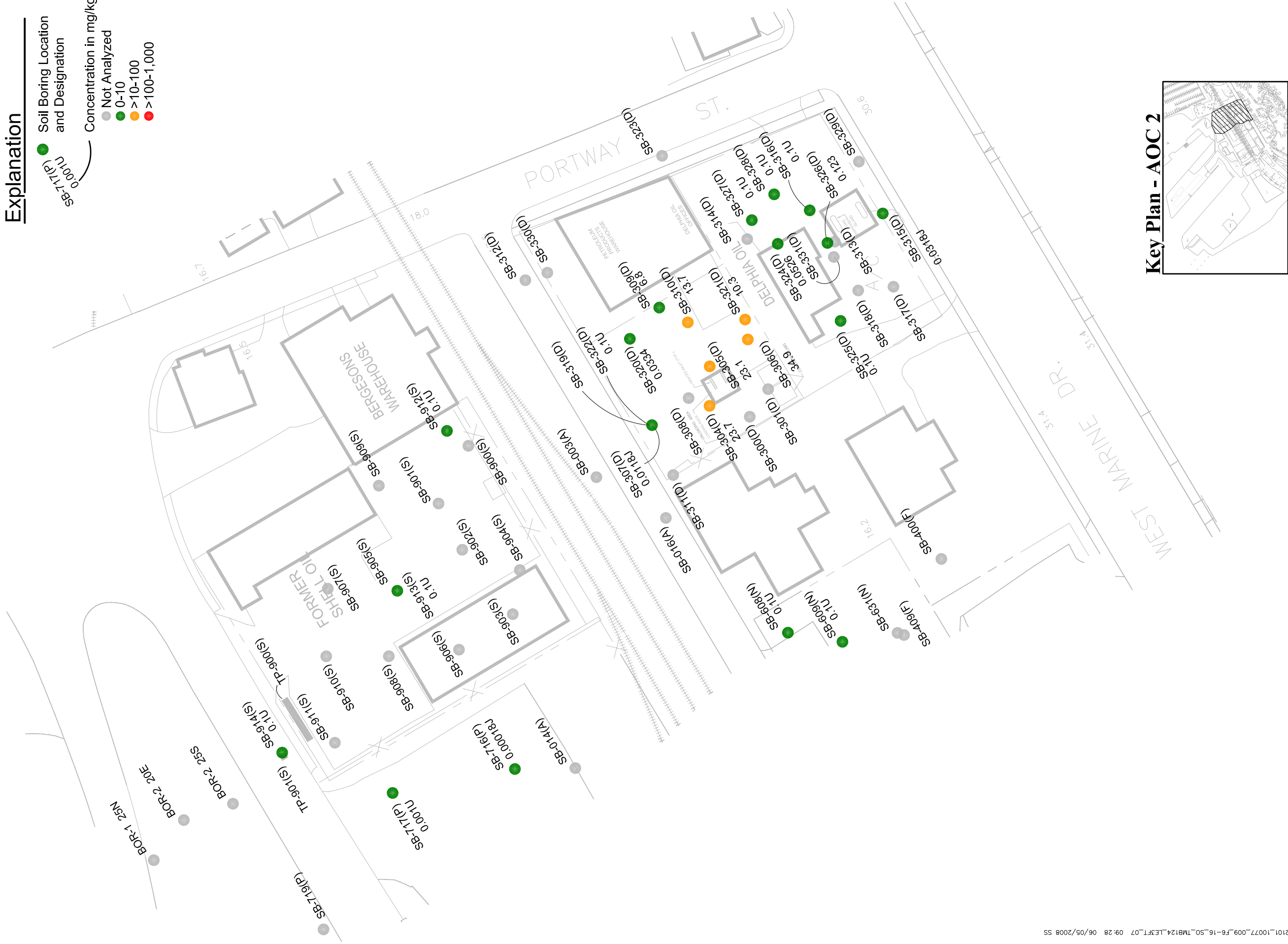
Key Plan - AOC 2