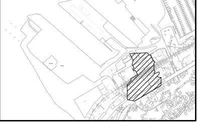
FIGURE 6-24 DIESEL RANGE HYDROCARBONS IN GROUND WATER - August 2004 - AOC 1 Remedial Investigation/Feasibility Study Astoria Area-Wide Petroleum Site Astoria, Oregon